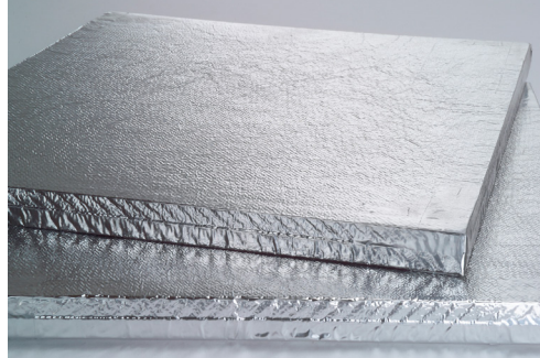
Vacuum insulation panel (VIP)

To accelerate the transformation of the built environment towards more energy efficient and sustainable buildings and communities, by the development and dissemination of knowledge and technologies through international collaborative research and innovation.